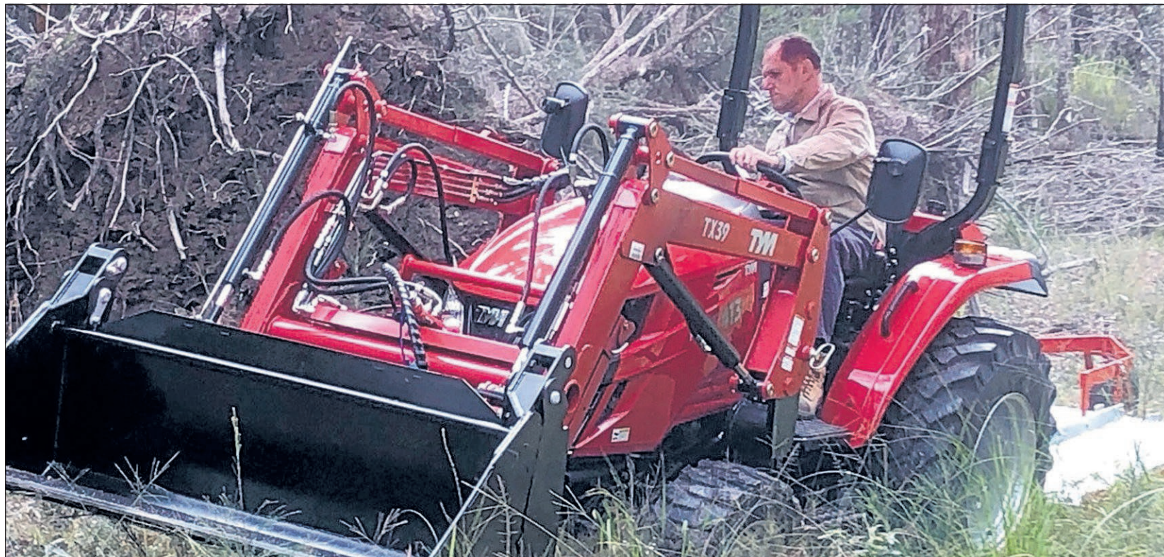
INNOVATIVE: TYM's T413 utility tractor packs a lot into a 38.4 hp tractor.

"Whether you are using a tractor every day, or a few times a month, farmers